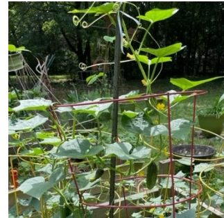
Dirt Diva's cucumbers