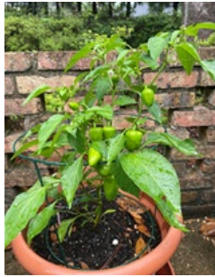
Harry's Eros peppers