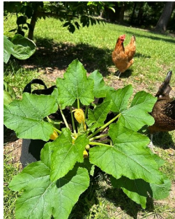
Carol's Multipik squash