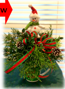
Cuppa Cheer $15