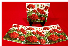
Coaster sets $10. Trivets $12 Many designs to choose from. Available at in person sale only