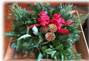
Table Arrangement $25

Greenery arrangement sizes are listed at: