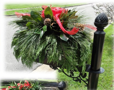
Large Mailbox topper $40

Choice of ribbon colors for online orders are red velveteen, red, gold, silver and new this year, blue. When ordering online please remember to use the drop-down menu to choose your ribbon. Greenery arrangements featuring more whimsical bows will be available at in-person sale.