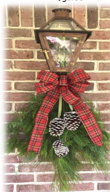
Individual Swag $25 Matching Pair Swag $40