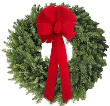
20"-22" $30 Frasier fir wreath with holiday bow fits a standard residential window