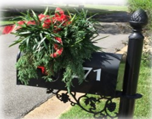
Small Mailbox topper $30.00