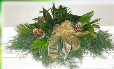
Mantle Arrangement $25